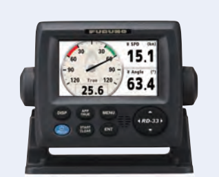
Remote Display RD-33

■ The PG-500 is subject tomagnetic anomalies, such asmagnetic deviation due tosteel hull, onboard cranes,nearby huge ships, marinecables, etc. as well as thelocal magnetic variation.