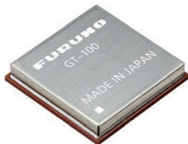
The GT-100 is a new generation of GNSS receiver module for time synchronization that supports dual band L1/L5 reception and is compatible with all constellations.

Multiple layers of systems and measures are utilized in order to maintain regular, stable operations in such infrastructure; one example of this is time synchronization based on Coordinated Universal Time (UTC) using satellites in a Global Navigation Satellite System (GNSS). The degree of time synchronization accuracy required by this system is far beyond the accuracy we require for scheduling day-to-day tasks using clocks. In 5G mobile communication networks, for