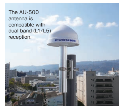
The AU-500 antenna is compatible with dual band (L1/L5) reception.

example, base stations must synchronize with accuracy down to the nanosecond level in order to prevent radio-wave interference and successfully provide voice calls and data transmission services.